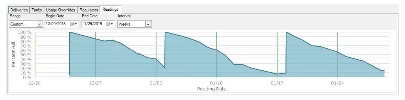
See deliveries, tanks, usage overrides, regulators, and readings.

Telemetry Partners – Interfacing with various telemetry providers gives you accurate upto-date tank readings. This telemetry data increases tank forecasting refill requirements, scheduling efficiencies, and more effective routing. TIMS interfaces with a variety of telemetry providers such as Pulsa®, Wise Telemetry®, CylConnect®, and Anova®.